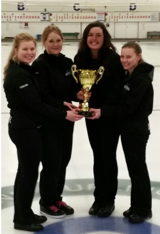
St. Theresa's Catholic High School: CSASC Open Girls Curling Champions