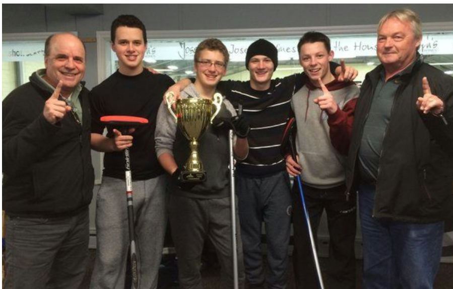
Jean Vanier Catholic High School: CSASC Open Boys Curling Champions