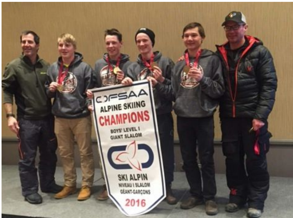
Jean Vanier Catholic High School: Level One Boys Giant Slalom, OFSAA Gold Medalists